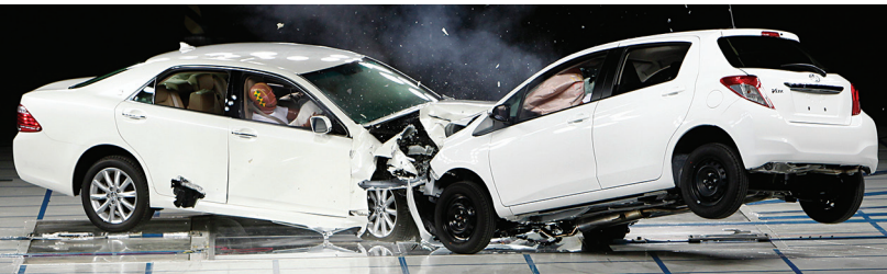
Proportion of fatal accidents involving drivers over age 75

The number of fatal accidents involving elderly drivers in Japan has almost doubled in the past decade, despite a fall in overall road deaths