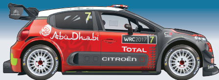
Citroën C3: Kris Meeke, winner of 2016 Finnish Rally