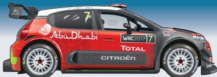
Citroen C3: Andreas Mikkelsen, winner of 2016 Polish Rally, then driving for VW