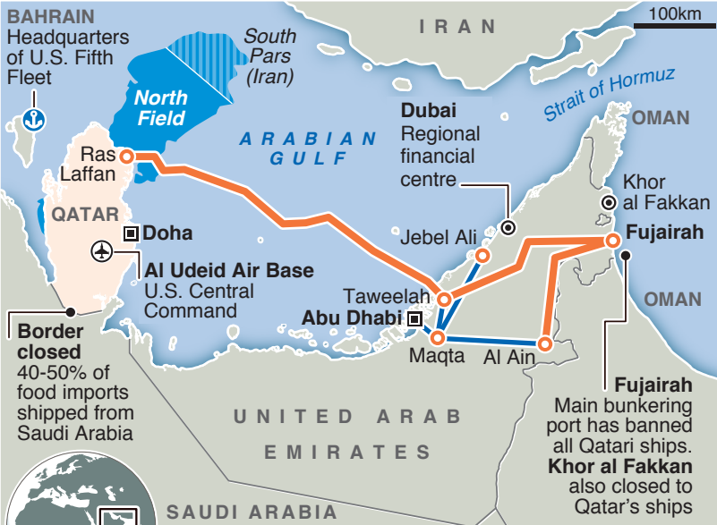
Qatar LNG exports (billion cubic metres, 2016)