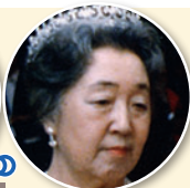
Empress Nagako 1903-2000