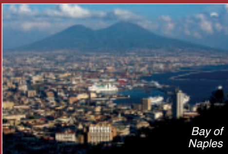
Bay of Naples

Volcanologists previously assumed that stress built up during periods of unrest dissipated during quieter intervals between them