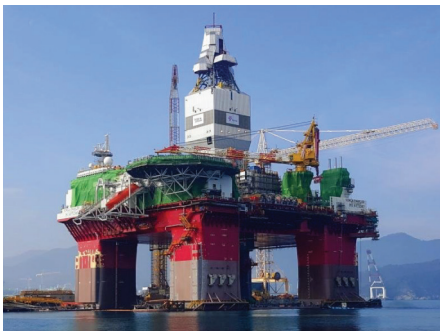
Songa Enabler: Norwegian firm Statoil plans to use mobile rig to drill five wells