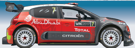
Citroën C3: Kris Meeke, winner of 2016 Portugal Rally