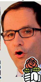
Benoit Hamon, 49: Socialist Party Left