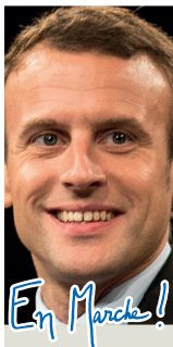
Emmanuel Macron, 39: On the Move! Centre

Polls show Emmanuel Macron and Marine Le Pen clinging on to the narrowest of leads, while a late surge by rightwinger François Fillon and hard-left candidate Jean-Luc Mélenchon appears to be holding