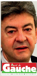
Jean Luc Melenchon, 65: Left Party Far left