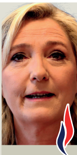
Marine Le Pen, 48: National Front Far right