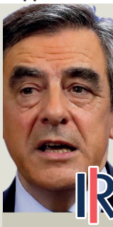
Francois Fillon, 63: Republican party Centre-right