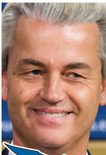
Geert Wilders Freedom Party

Dutch voters are preparing to elect a new lower house, as polls predict a tight contest between prime minister Mark Rutte and Freedom Party leader Geert Wilders, for the right to form a new coalition government