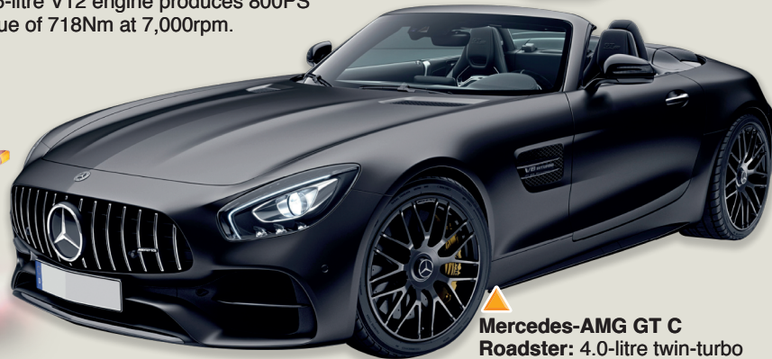
▶ Mercedes-AMG GT C Roadster: 4.0-litre twin-turbo V8 generates 554.8PS and 0-100km/h in 3.7 seconds