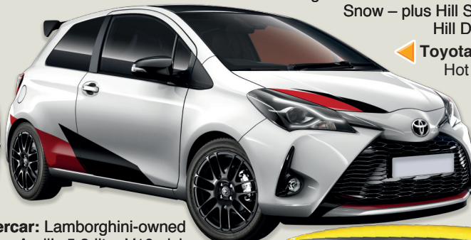
▶ Toyota Yaris GRMN: Hot hatch features supercharged 1.8-litre petrol engine with 250PS. Expect class-breaking 0-100km/h in 6 seconds