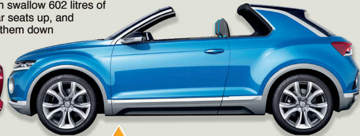
▶ Volkswagen T-ROC: Concept crossover features removable roof halves. Driving modes include Street, Off-road and Snow – plus Hill Start Assist and Hill Descent Control