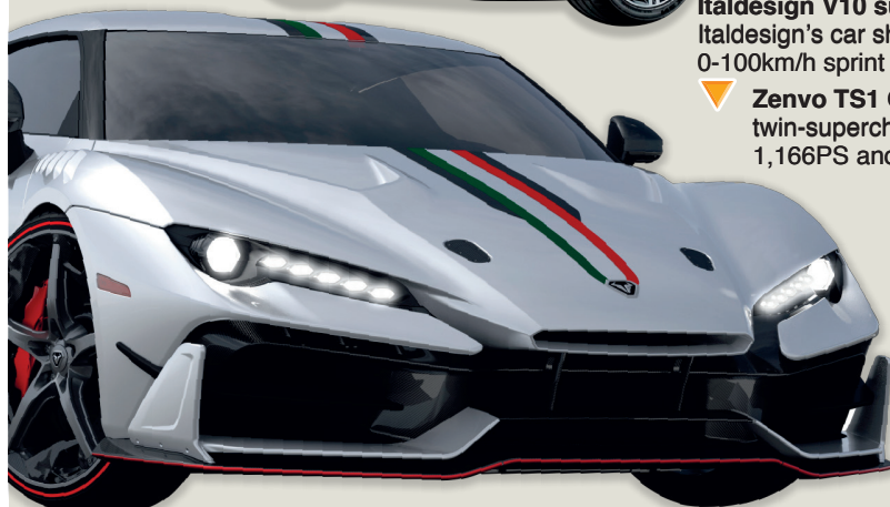
▶ Zenvo TS1 GT: Danish two-seater's twin-supercharged 5.8-litre V8 delivers 1,166PS and tops 400km/h