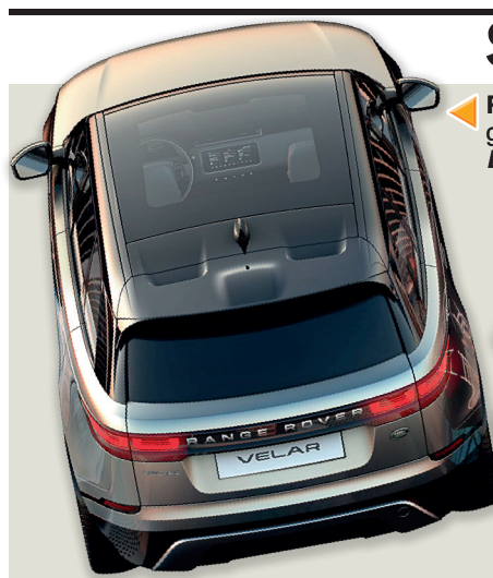
▶ Range Rover Velar: New SUV with full-length glass roof. Fills gap between entry-level Evoque and Range Rover Sport