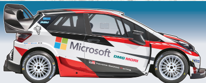
Jari-Matti Latvala (Toyota) Mexico 2016 winner, then driving for VW