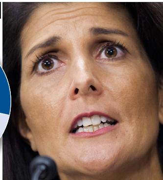
Nikki Haley: Seeking to lower U.S. share of funding to below 25%