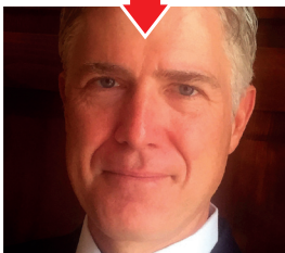
Neil Gorsuch, 49

Strong advocate for "originalism" – idea that Constitution should be strictly interpreted as Founding Fathers would have done, more than 200 years ago