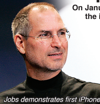
Jobs demonstrates first iPhone