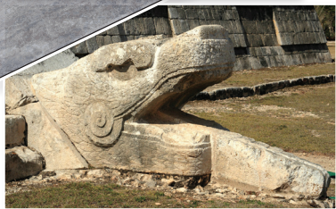
Kukulcan – Maya Feathered Serpent deity at base of temple's stairway

Pyramid discovered using 3D Electrical Tomography – non-invasive technique that measures resistance in flow of electrical current to digitally map interior of existing structure