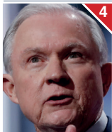
4. Jeff Sessions, 69: Contender for Defence Secretary – most powerful job in cabinet