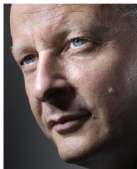
Bruno Le Maire