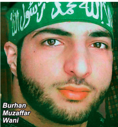
Burhan Muzaffar Wani

Increasing tension between India and Pakistan is stoking fears of an escalation into a major clash between the two nuclear powers