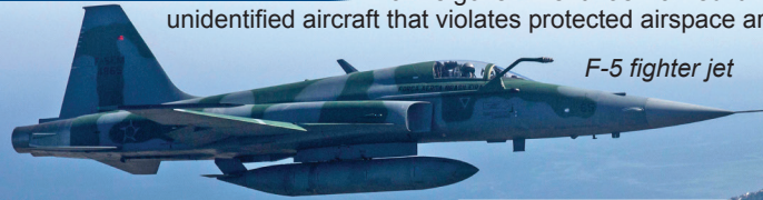
F-5 fighter jet

Brazil's government has warned it will shoot down any unidentified aircraft that violates protected airspace around Olympic facilities