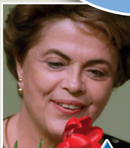
Dilma Rousseff Brazil – powers suspended in May 2016