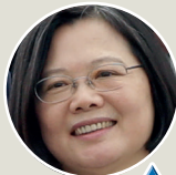
Tsai Ing-wen Taiwan