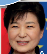
Park Geun-hye South Korea