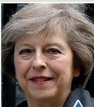
Theresa May United Kingdom