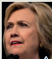
Hillary Clinton Democratic nominee in U.S. presidential election