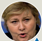
Erna Solberg Norway