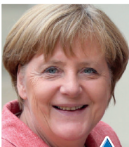
Angela Merkel Germany