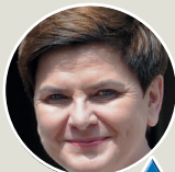
Beata Szydlo Poland