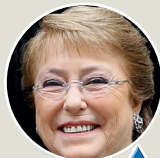
Michelle Bachelet Chile