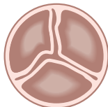
Diseased valve closed