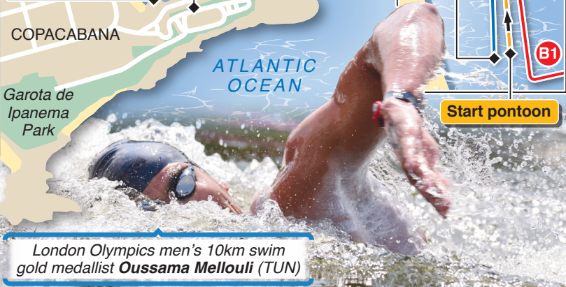
London Olympics men's 10km swim gold medallist Oussama Mellouli (TUN)