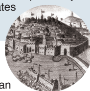
Port of Algiers

■ 1575: Cervantes sets sail for Spain but is captured by Barbary pirates and taken to Algiers