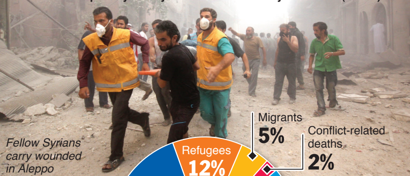
Fellow Syrians carry wounded in Aleppo

More than 11.5 percent of Syria's population have been killed or injured since the bloody crisis in the country erupted in March 2011, according to a new report by the Syrian Centre for Policy Research (SCPR)