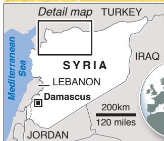
AREAS OF CONTROL (as of Jan 18, 2016)