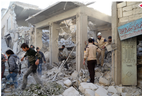
Heavy damage following Russian airstrikes in Ariha

Russia has used cluster munitions and unguided bombs on civilian areas in Syria in attacks that killed hundreds of people in the past few months, according to a report by rights group Amnesty International