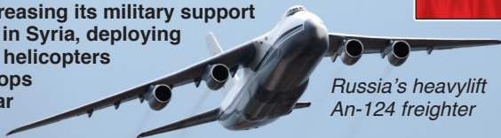
Russia's heavylift An-124 freighter

Russia is sharply increasing its military support for the Assad regime in Syria, deploying dozens of aircraft and helicopters and thousands of troops to its new airbase near the port of Latakia