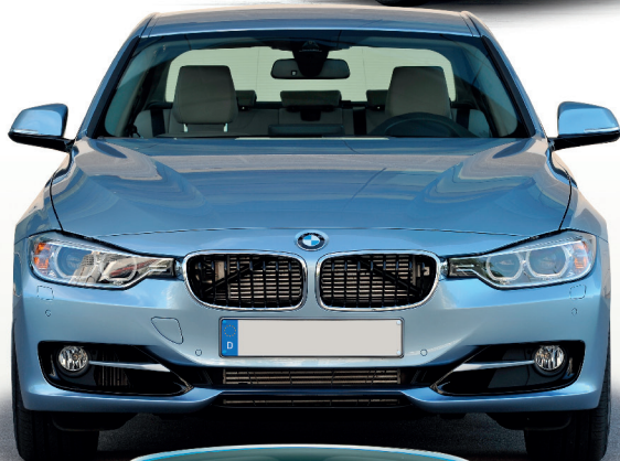
BMW: New hybrid variants with prices around €73,000