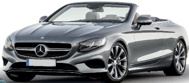
Mercedes-Benz S-Class Cabriolet: Four-seat luxury convertible, costing upwards of €137,000