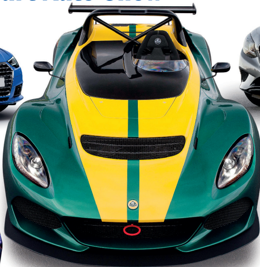
Lotus 3-Eleven: New generation of sports cars. €113,000-€158,000 depending on specification