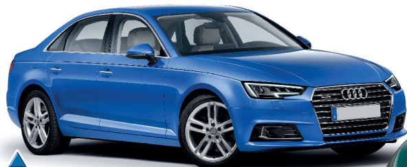
Audi A4: Fifth-generation A4s with new engines and styling. Prices from €35,600