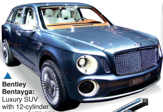
Bentley Bentayga: Luxury SUV with 12-cylinder engine. €179,000