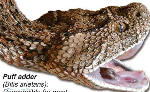
Puff adder ( Bitis arietans ): Responsible for most snakebite fatalities in Africa

One of the world's most effective snakebite treatments is to be withdrawn, putting tens of thousands of lives at risk. Fresh supplies of Fav-Afrique, which neutralises 10 different snakebites in sub-Saharan Africa, are desperately needed