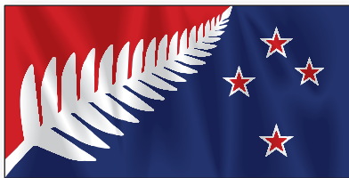
Silver Fern (Red, White and Blue) Kyle Lockwood