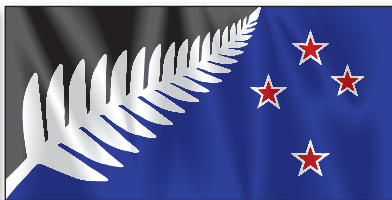
Silver Fern (Black, White and Blue) Kyle Lockwood