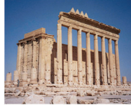
Temple of Bel: Most important religious buildings of 1st Century in East