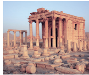
Temple of Baalshamin: Destroyed