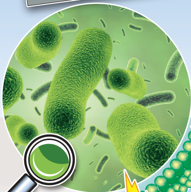
Bacteria cell wall

3. Silver ions — positively-charged particles — interfere with bacterium's metabolism, producing extremely toxic substances called reactive oxygen species (ROS)