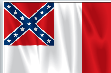
Blood-Stained Banner 1865. Red bar added to avoid confusion with flag of truce

STATE FLAGS: Various aspects of Confederate flags incorporated