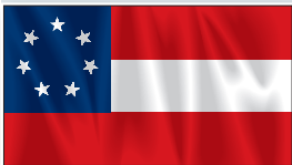
Stars and Bars 1861-63. Extra stars added as more states joined confederacy

“REAL” CONFEDERATE FLAG: Confederate States of America – states that supported slave ownership and wanted to secede from United States – used three different flags during war