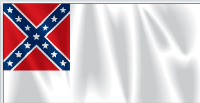
Stainless Banner 1863-65. Incorporated battle flag as canton on white field