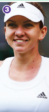
3 Simona Halep (ROM) 23

Hoping to bounce back after crashing out in second round at Roland Garros. Reached semi-finals at Wimbledon in 2014, losing out to fellow starlet Eugenie Bouchard