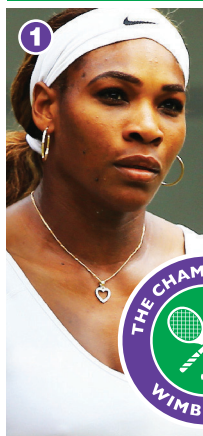
1 Serena Williams (USA) Age: 33

Five-time champion aiming for calendar Grand Slam after Australian Open and Roland Garros titles. Suffered shock early exits in recent years, losing in third round in 2014