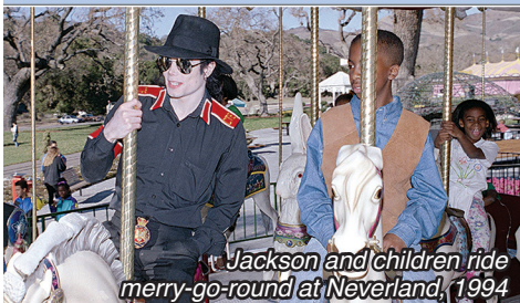
Jackson and children ride merry-go-round at Neverland, 1994

■ 2008: Investment firm Colony Capital enters into joint ownership deal with Jackson after bailing him out of $23m debt