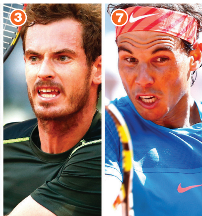
2 Roger Federer (SUI) 33

Claimed first ever clay court titles after impressive performances in Munich and Madrid – hoping to make first final in Paris and continue unbeaten streak following marriage to Kim Sears