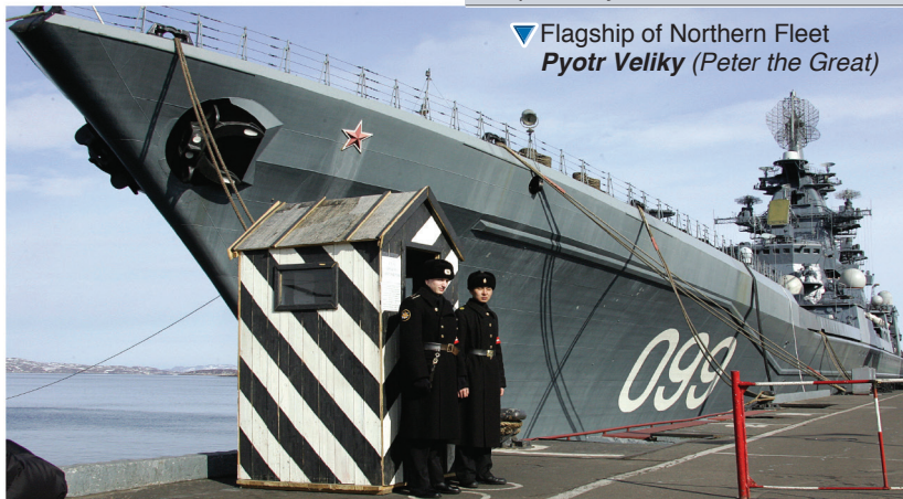
▼ Flagship of Northern Fleet Pyotr Veliky (Peter the Great)

■ Mar 16: Putin orders Northern Fleet – with 38,000 troops, 41 ships, 15 submarines and over 100 aircraft – to full combat readiness as part of snap military exercise