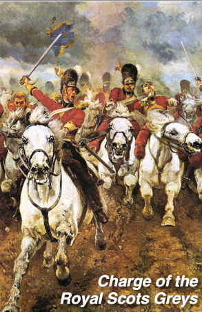
Charge of the Royal Scots Greys