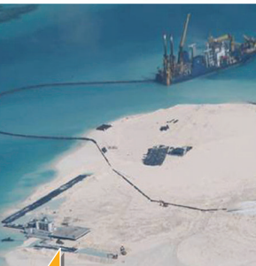
Johnson South Reef Military structure, Feb 2014