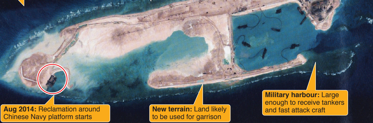
Aug 2014: Reclamation around Chinese Navy platform starts

Reclaimed land: 3,000m long and up to 300m wide. Runway could support attack aircraft and aerial refuelling tankers