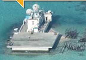
Johnson South Reef Military structure, Feb 2013