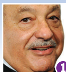
Carlos Slim Helu & family (Mexico)