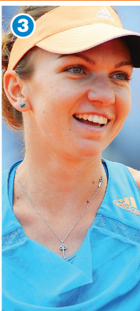
3 Simona Halep (ROM) 23

Australian Open champion in 2008 – last Grand Slam victory before winning a fifth at Roland Garros in 2014. Ended year ranked world No. 2 for third time in her career