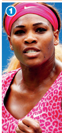
1 Serena Williams (USA) Age: 33

Five-time Australian Open champion hoping to extend dominance against ever-growing pack of improving, younger rivals. Suffered shock early exit to Ana Ivanovic in 2014