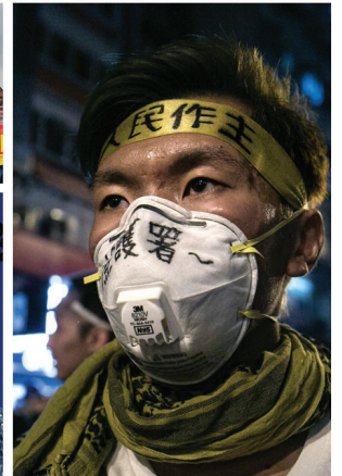
October: Hong Kong