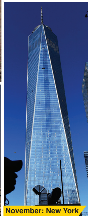
November: New York