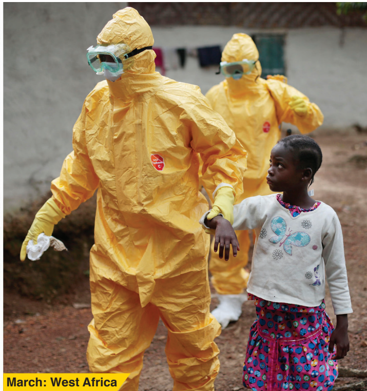
March: West Africa

APR 14 More than 270 girls are abducted from a school in northeastern Nigeria by the Islamist terrorist group Boko Haram