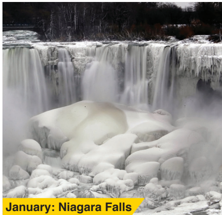
January: Niagara Falls