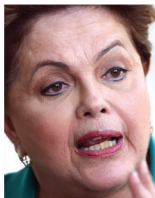
Dilma Rousseff Workers' Party