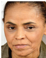
Marina Silva Socialist Party