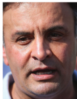
Aécio Neves PSDB

*Datafolha survey of 7,520 people, Sep 29-30. Margin of error: \pm 2 points