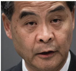
Leung Chun-ying: HK Chief Executive