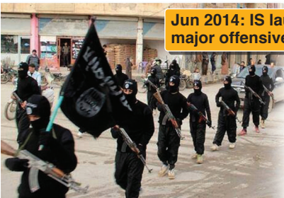
Jun 2014: IS launches major offensive

Islamic State militants are committing ethnic cleansing on a “historic scale” and threatening to wipe Iraq’s ancient minorities off the map forever, according to Amnesty International