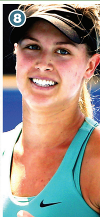
8 Eugenie Bouchard (CAN) 20

Enjoying stellar season, reaching first Grand Slam final at Roland Garros and semis at Wimbledon. At career-high rank of No. 2, but has yet to advance past fourth round at U.S. Open