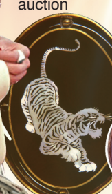
$957,500 – Jerry Garcia's "Tiger" guitar: Custom-made guitar was Garcia's main instrument during his time with Grateful Dead . 2002, Guernsey's auction