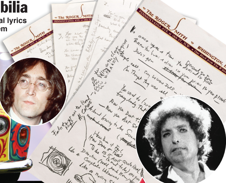
Like a Rolling Stone Draft written in pencil on hotel letterhead stationery with revisions, additions, notes and doodles. Dylan was 24 when he recorded the song in 1965