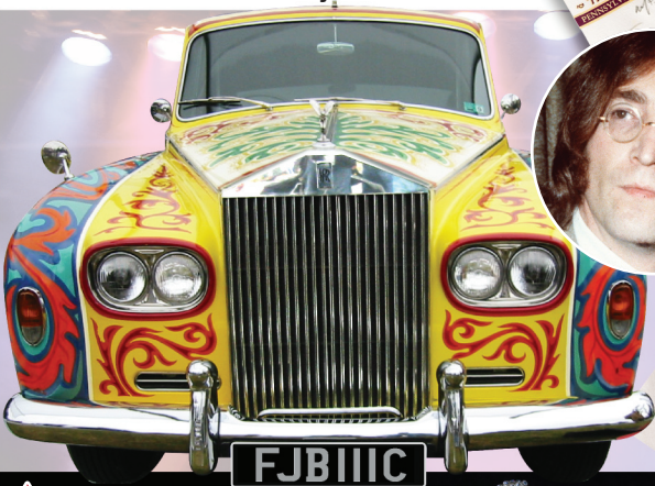
$2.23 million – John Lennon's limo: Priciest Beatles collectible, Lennon's hand-painted Rolls Royce Phantom V. 1985, Sotheby's

The only known surviving draft of the final lyrics of Bob Dylan's transformative rock anthem Like a Rolling Stone has sold for $2.045 million at Sotheby's in New York