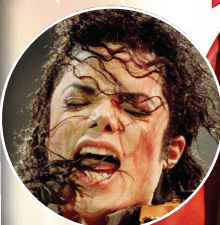
$1.8 million – Thriller jacket: Michael Jackson's catskin jacket worn in Thriller video, 2011, Julien's