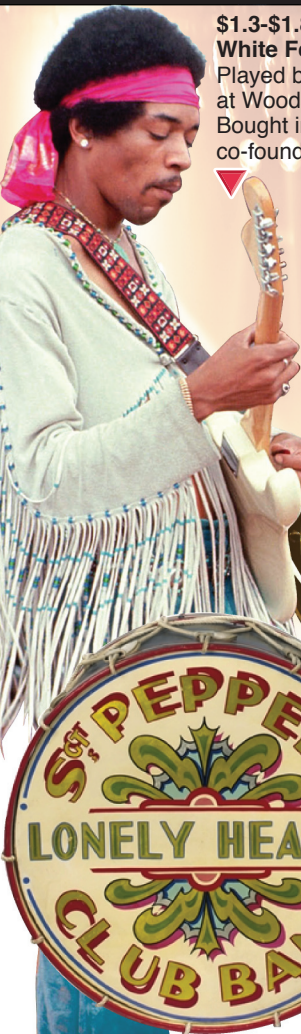
$1.3-$1.8 million – Olympic White Fender Stratocaster: Played by Jimi Hendrix at Woodstock in 1969. Bought in 1993 by Microsoft co-founder Paul Allen