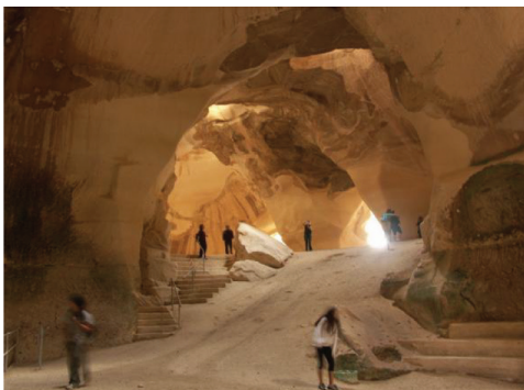
Bell caves: Some 800 pits, many linked by tunnels, are remains of man-made quarries

► History: Caves situated below ancient city of Maresha, dating from third century BC, and later, Roman-era town of Beit Guvrin