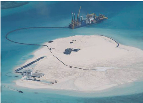
▲ Chinese ship expanding structures and land on Johnson South Reef, Feb 2014

Spratly Islands: Claimed by China, Vietnam, Philippines, Malaysia and Taiwan